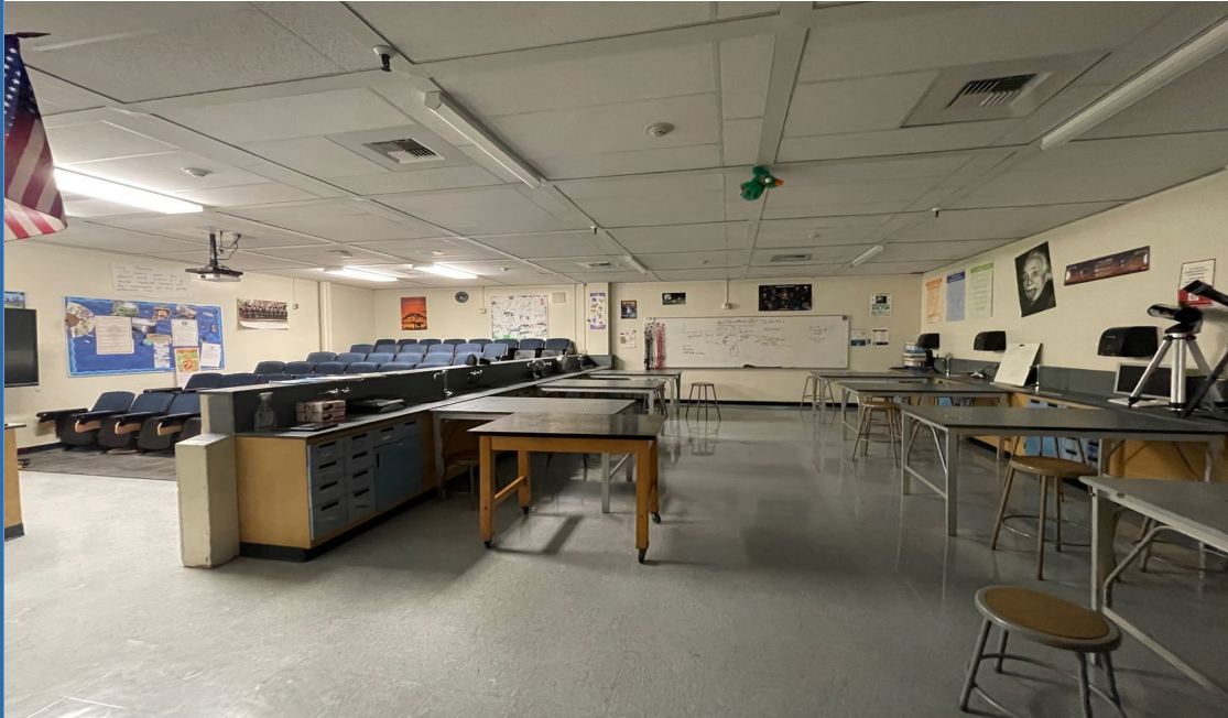
SONORA HS - SCIENCE CLASSROOM MOD