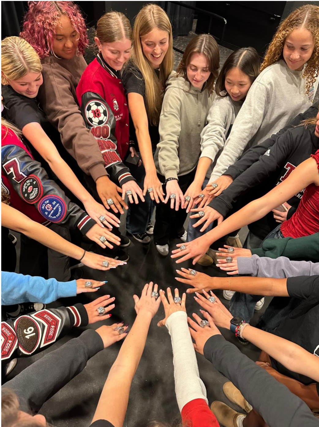
photo) were Troy's deserving standouts! Thank you to all of these students for not letting obstacles stop them from their dreams and continuing to persevere and move forward! All of you are an inspiration for me and many others!