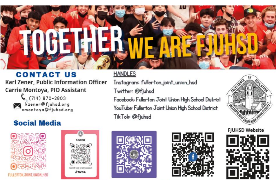
Stay Connected: www.fjuhsd.org

• National Alliance on Mental Illness (for OC): https://www.namioc.org/