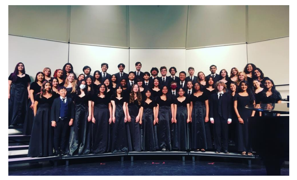
Troy's Vocal Music Director reports some wonderful news on some recent choir festivals

It has been another typically busy week for all of us at Troy, so here is a glimpse of what we had going on this week!