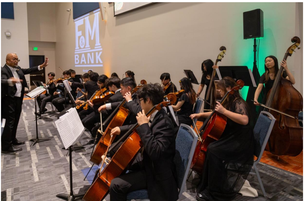
Yesterday our Troy Band, Guard, and Orchestra performed at the 2024 City of Fullerton State of the City! Our very proud Director of Instrumental Music wrote; "We had the opportunity to represent Troy High School at the state of the City of Fullerton with Mayor