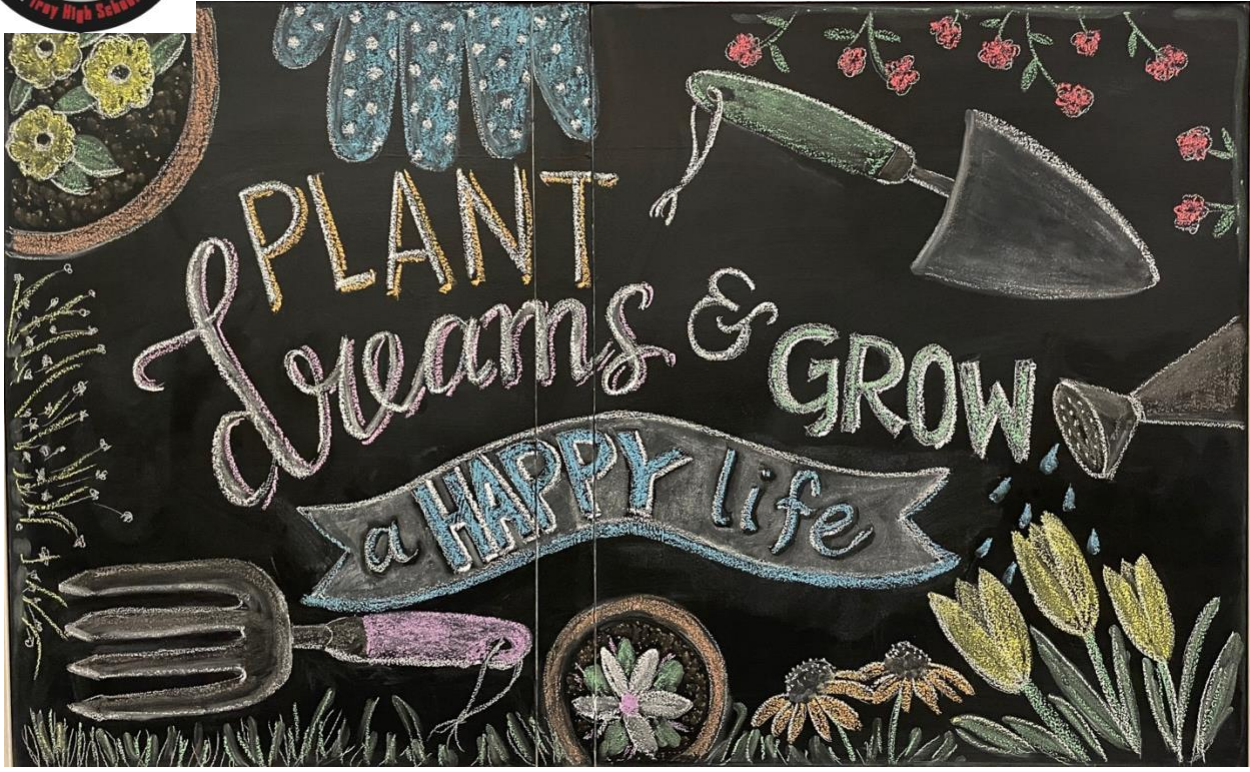
April 5, 2024