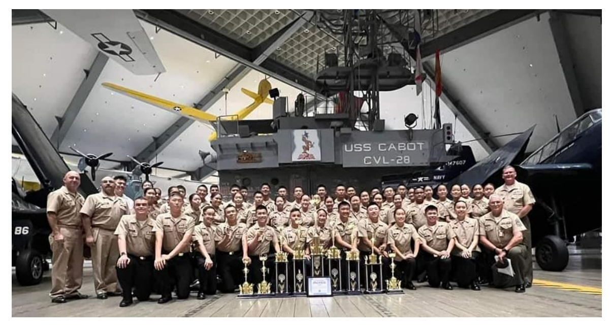
Last weekend, our NJROTC cadets were in Pensacola, Florida competing in the NJROTC

You may notice a different picture at the top of the Warrior Weekly . While I tend to make the header photo representative of the seasons, we have made an abrupt shift from winter / spring to mid-summer. 100 degree temperatures in mid-April? Not awesome. It is supposed to cool down tomorrow. However, these warm temperatures are going to make for a great night for the Troy ASB movie event night tonight beginning at 6pm! Let's go, Warriors!