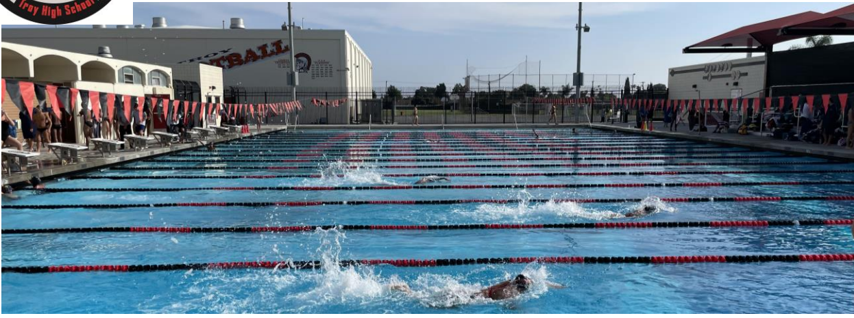
April 8, 2022