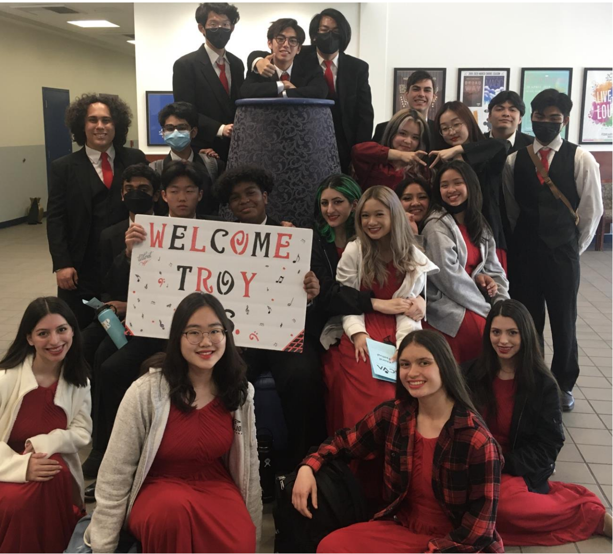
When I wrote about our choir last week I gave a preview into subsequent events. Choir