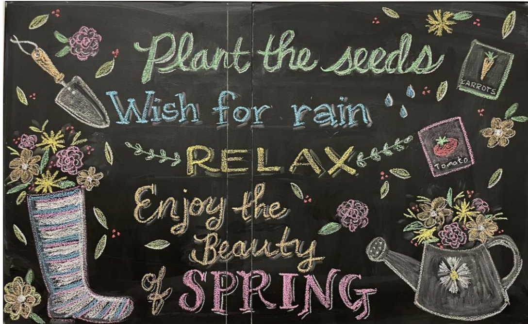
Artist: Ms. Shannon Cogswell

https://mail.google.com/mail/u/0?ui=2&ik=8bccad7511&attid=0.1&permmsgid=msg-f:1718061514680932986&th=17d7c7d84cd39a7a&view=att&disp=inline&realattid=f_kwp79z6i0