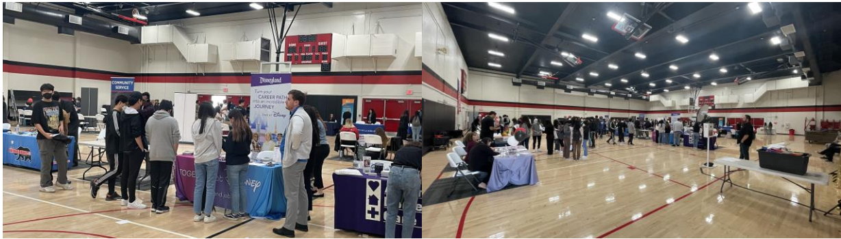
Summer Job Fair, held in the South Gym at Troy High School, May 18, 2022.