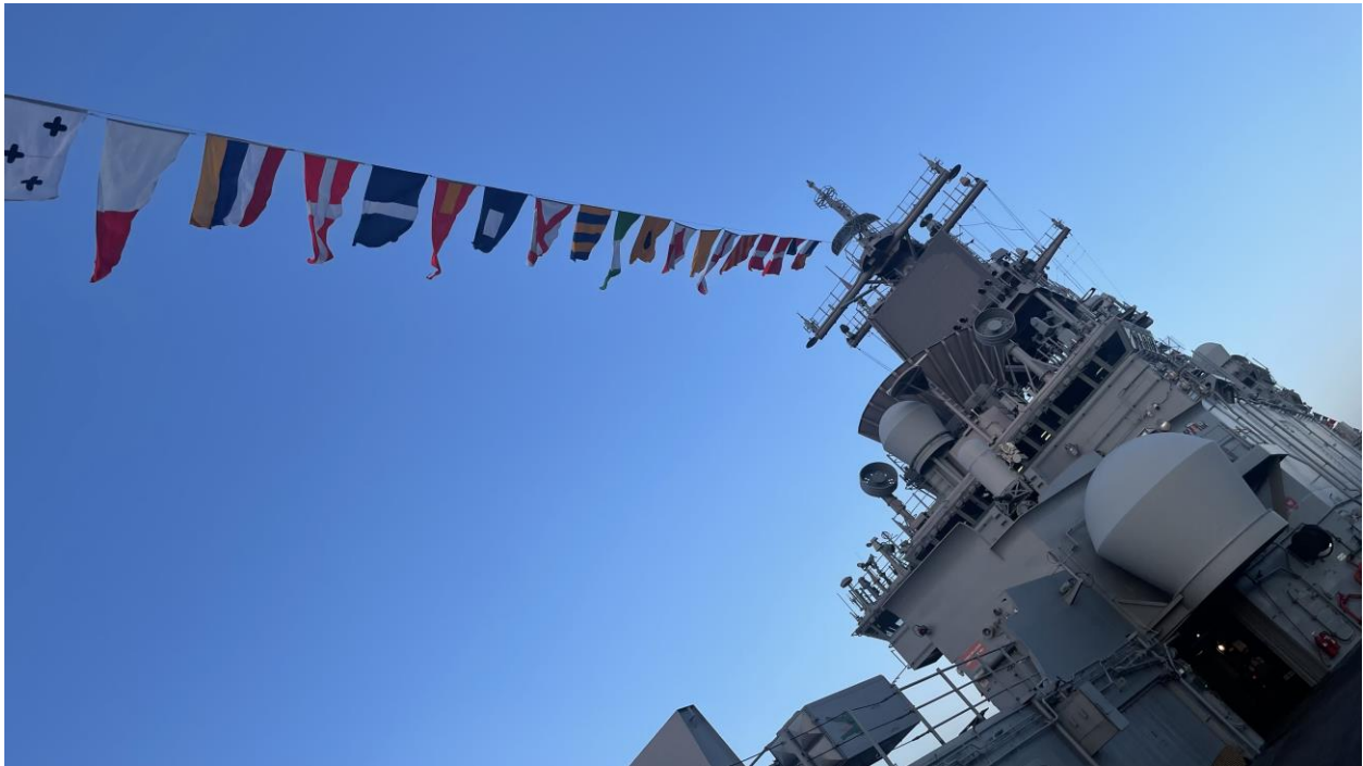
L.A. Fleet Week—U.S.S. Essex, May 26, 2022

But wait, there is more end of the 2021-2022 school year news! For everyone but our Class of 2022, Final Exams will begin on Tuesday, May 31st through Thursday, June 2 nd . Seniors will have a full week of school events beginning on Tuesday, May 31 st with the Senior Breakfast at Splitsville , Downtown Disney. The next day, on Wednesday, June 1 st the fun really begins with mandatory Graduation Rehearsal from 10:30am-1pm at Fullerton Stadium. This is when seniors will be given their allotment of graduation tickets. Later in the evening on June 1 st Senior Reflections will be held in the North Gym beginning at 6:00pm.