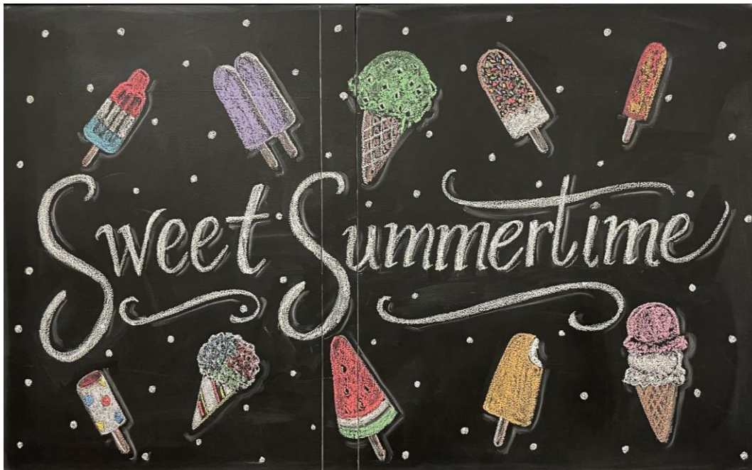
Artist: Ms. Shannon Cogswell

https://mail.google.com/mail/u/0?ui=2&ik=8bccad7511&attid=0.1&permmsgid=msg-f:1718061514680932986&th=17d7c7d84cd39a7a&view=att&disp=inline&realattid=f_kwp79z6i0