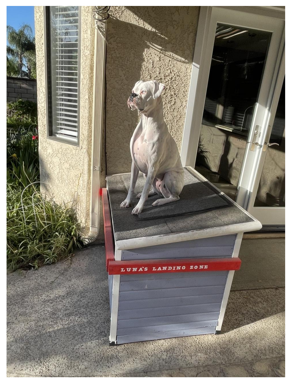
Ok, I'm ready. Where are we going?

school in person, five days a week!!!! <sup>©</sup> We will be surrounded by real people, not screens for our lessons!