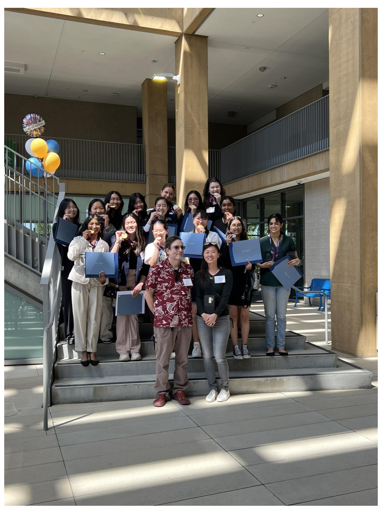
On April 20th nineteen Troy students were recognized for NCWIT Aspirations in Computing