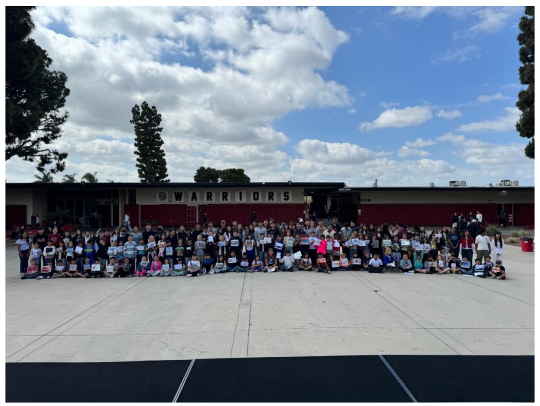
become authors of their own narratives, the project in its second year successfully instilled confidence and creativity in the high school students." This is an awesome partnership!