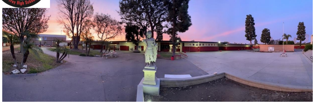
May 3, 2024

Warriors, it is prime time! We have less than a month of school, and spring sports are wrapping up. Since April 25<sup>th</sup> we have been in IB testing, April 26<sup>th</sup> Cambridge testing began, and on Monday, May 6<sup>th</sup>, the AP exams begin! This is also the time of year to ensure you are getting enough rest, sleep, nutrition, and take breaks so you spend some time with friends and family. Finding balance in your life when things get busy will help you do better in all areas, which is much easier said than done, but awareness is the first step in the right direction. We all know Finals are right around the corner so this is the time to keep focused on the finish line and go through strong through the end of the school year and into summer! Warriors, keep it going!