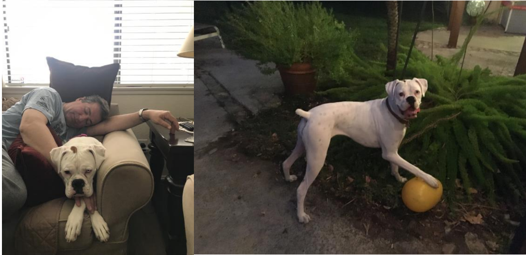
Resting, relaxing, and recharging...☺

and I look forward to hearing about them during the summer and as we begin the 2019-20 school year on August 12, 2019 the first day of school with students! In the meantime, it is summer! I hope everyone will make sure to get in the needed rest, relaxation, recharge, all of us need to be ready for the beginning of the school year! Have a wonderful summertime, and I will see everyone back here on Monday morning, August 12, 2019!