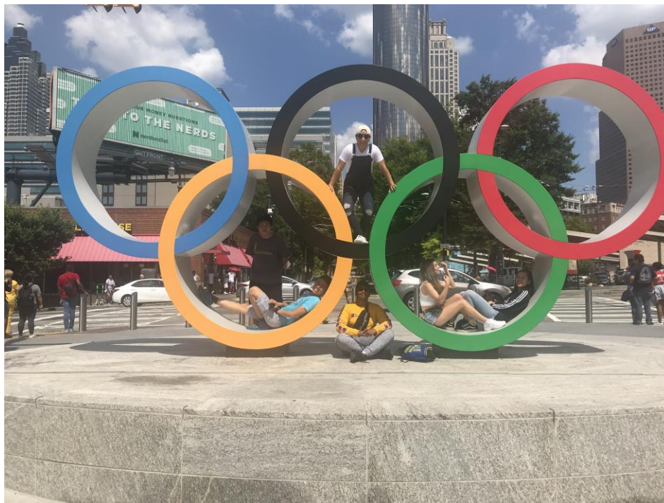
Troy NJROTC Quiz Bowl team in Atlanta, Georgia. Rest, relax, enjoy the summer!