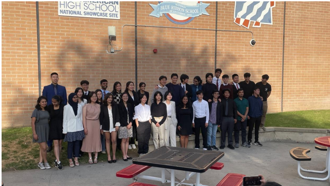
Here are Troy's IB diploma candidates from our Class of 2024, taken last week before the IB recognition ceremony. Congratulations to all of our IB diploma candidates!